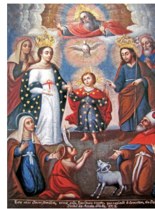
Fig. 2 Holy Kinship , Cuzco School, 1783. Barbosa Stern Collection, Lima