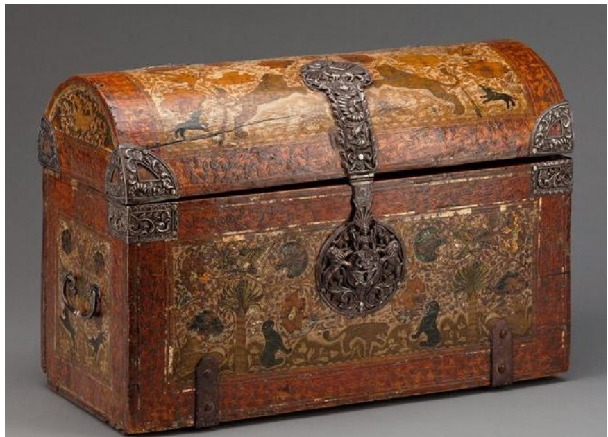
Barniz de pasto casket, 17 th century, Denver Museum of Art