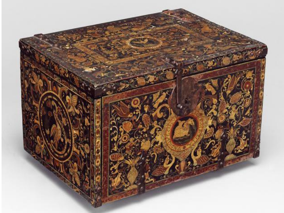
Barniz de Pasto Casket, Colombia, 17 th century, Victoria & Albert Museum