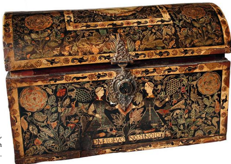
Barniz de Pasto Viceyoyalty casket, 2 nd half of 17 th century, exposition of museo de Asturias.