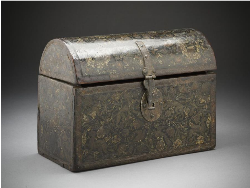
Barniz de Pasto Casket, Colombia, 17 th century, (Los Angeles County Museum of Art)